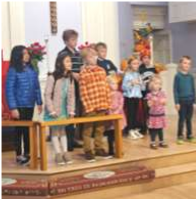
Left: Sunday School students share a song.