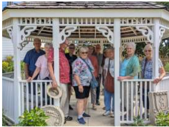
Daytimers are out and about