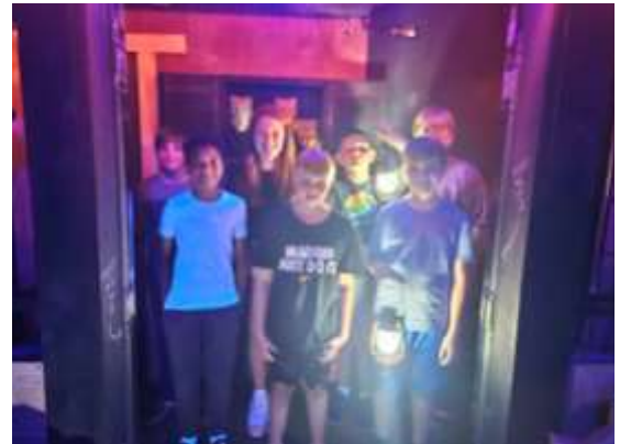
Right: Middle schoolers beat the escape room!