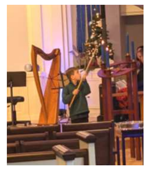
Lighting the Advent Wreath