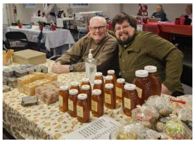
Above and right: Christmas Marketplace and Bake Sale