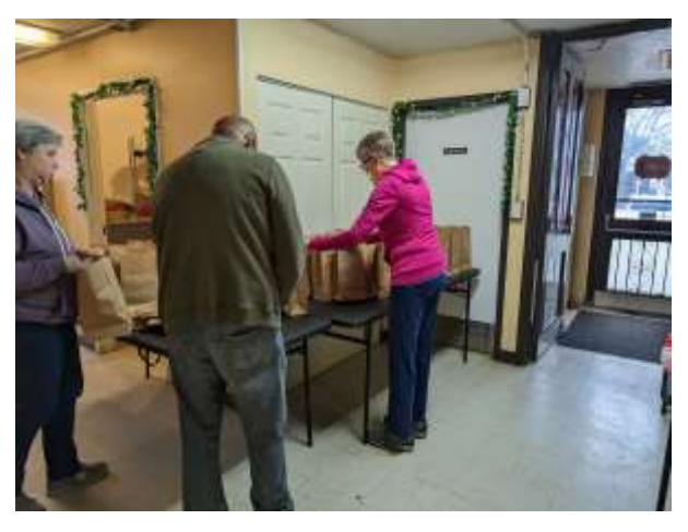
Above and below: Serving at Bethel during Christmas week