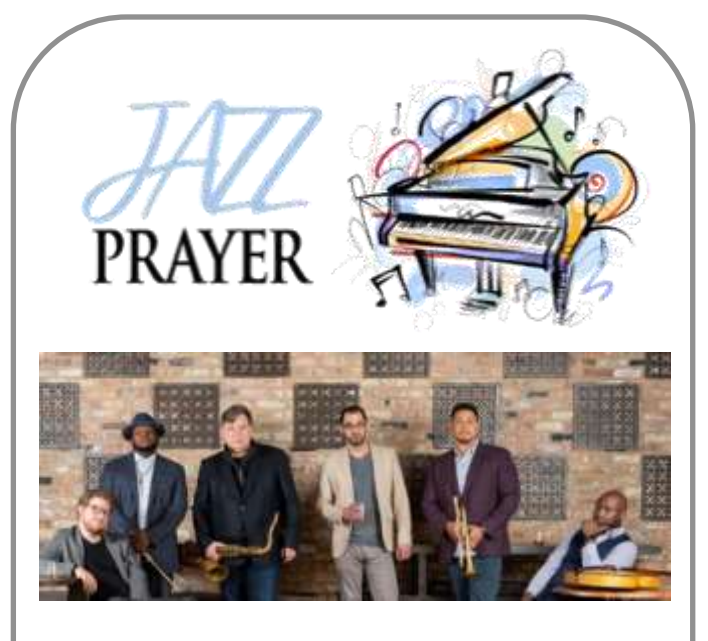
Jazz Prayer – January 19

Let Your Soul Glow as we welcome the Chicago Soul Jazz Collective.