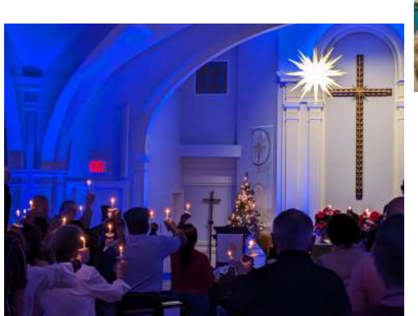
Candles are lifted while singing Silent Night on Christmas Eve