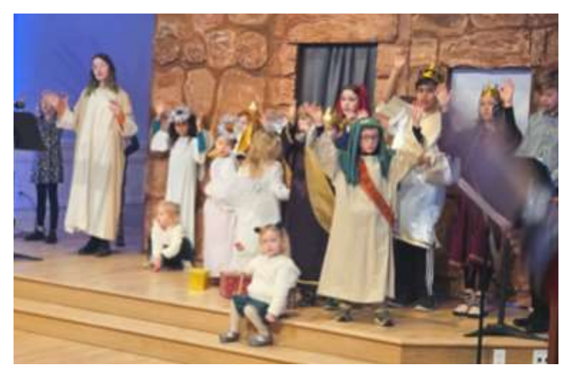
Children tell the Christmas story.