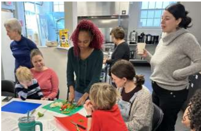
Thanks to all who participated in Yirari's arepas cooking class! It was so much fun and the results tasted amazing!