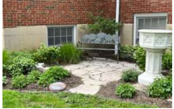
Good Shepherd's Memorial Garden

As you've noticed, our gardens at Good Shepherd are waking up from their winter sleep. Look for the little pasque flowers planted near the steps to the sanctuary; they just started blooming in time for Easter! These were purchased using previous years' Easter donations.