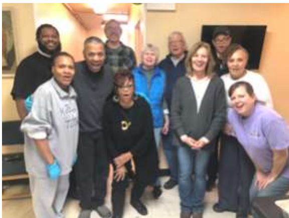
Bethel and Good Shepherd members work together to provide hot lunches. Join the team!