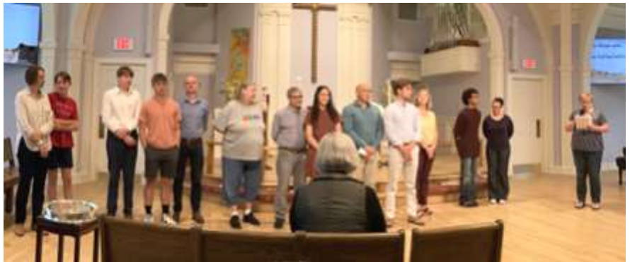
Eighth grade, high school, and college grads were celebrated on June 11!