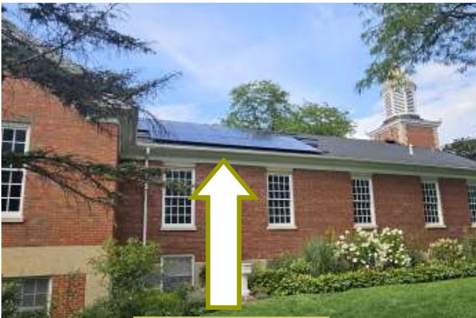
We've gone solar!

Thanks to the generosity of so many people who have contributed (and continue to contribute) to the Capital Campaign Fund, and thanks to the settlement of our insurance claim from repairs to the building following the fire of 2018, Good Shepherd has made a significant payment of principal to our mortgage debt which significantly reduces our interest expense, and positions us to raise the funds needed to complete the building renovation that has been a focal point of Good Shepherd's facility renewal plan for over three decades. Architecture plans have been refreshed, priorities have been clarified, expense projections are in the works and the vision and story of Good Shepherd's journey to be ever more welcoming is revitalized. Be on the lookout for more information about the next phase of our building renewal plan throughout the month of September. And prayerfully consider your participation and support of the next phase of Good Shepherd's journey to make our building ever more welcoming to all. For more information, and to share your interest in becoming a part of the planning team, contact the church office.