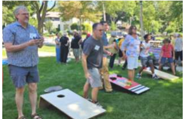
Bags Tournament is fun for all ages!