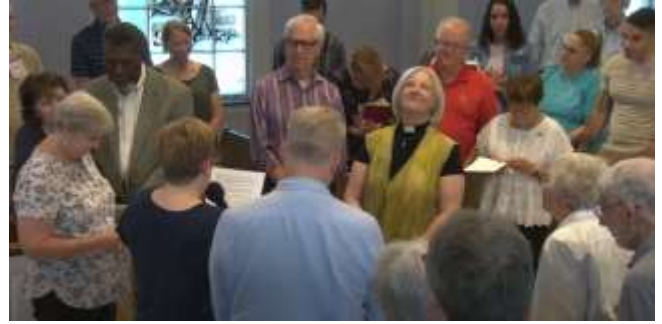
Prayer of blessing for 15 years at Good Shepherd