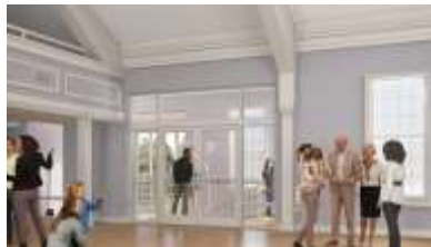
Conceptualizations of new East Ave entrance, exterior and interior.

The Phase 2 Task Force recently received a qualified cost estimate of approximately $1.5 million for the new elevator, entrance vestibule and nursery renovation; and a qualified construction cost estimate of $150,000 for replacement of the fire escape. Given the immediate need for a new fire escape and the available funds to pay for this replacement (see “Financial Reserves” above), the Phase 2 Task Force has recommended to the Council, and the Council has proposed to the congregation via the resolution for congregation consideration and vote on October 1, that funding be approved to replace the fire escape (“Phase 2a”) following receipt of at least three competitive bids from potential contractors. The need for new donations in addition to those previously pledged is evident given the $1.5 million estimate for installation of the elevator, construction of the entrance vestibule and nursery (“Phase 2b”). The timing of this new capital campaign appeal which will enable the commencement of Phase 2b will be discussed during the meeting of the congregation on October 1, in subsequent congregational meetings, and in prayerful dialogue with God and with one another.